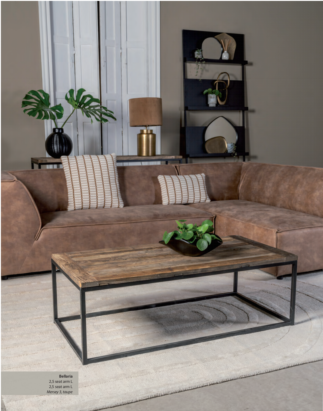
Bellaria 2,5 seat arm L 2,5 seat arm L Mersey 3, taupe