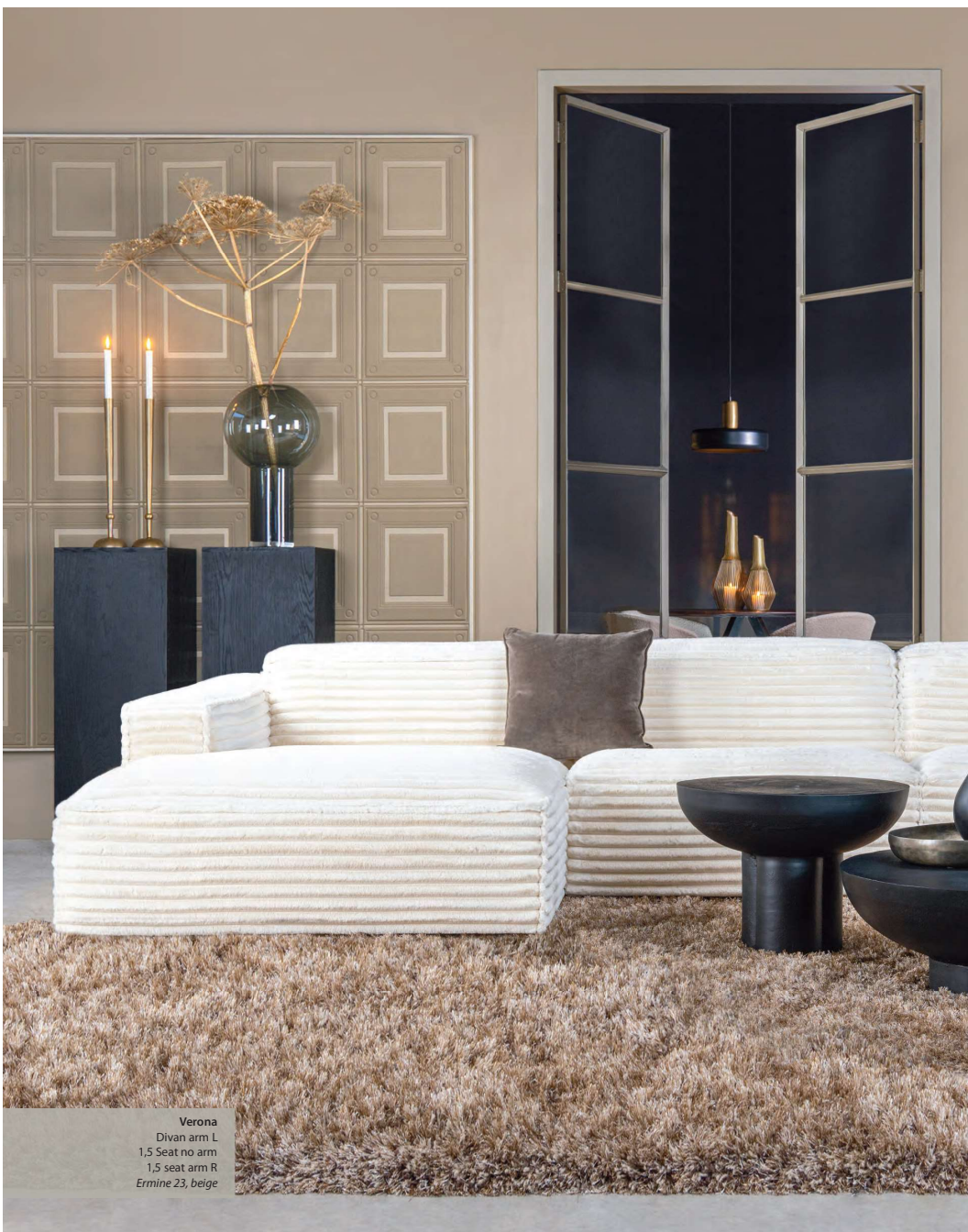
Verona Divan arm L 1,5 Seat no arm 1,5 seat arm R Ermine 23, beige